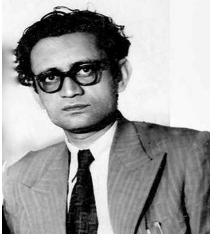
Saadat Hasan Manto (1912 – 1955)